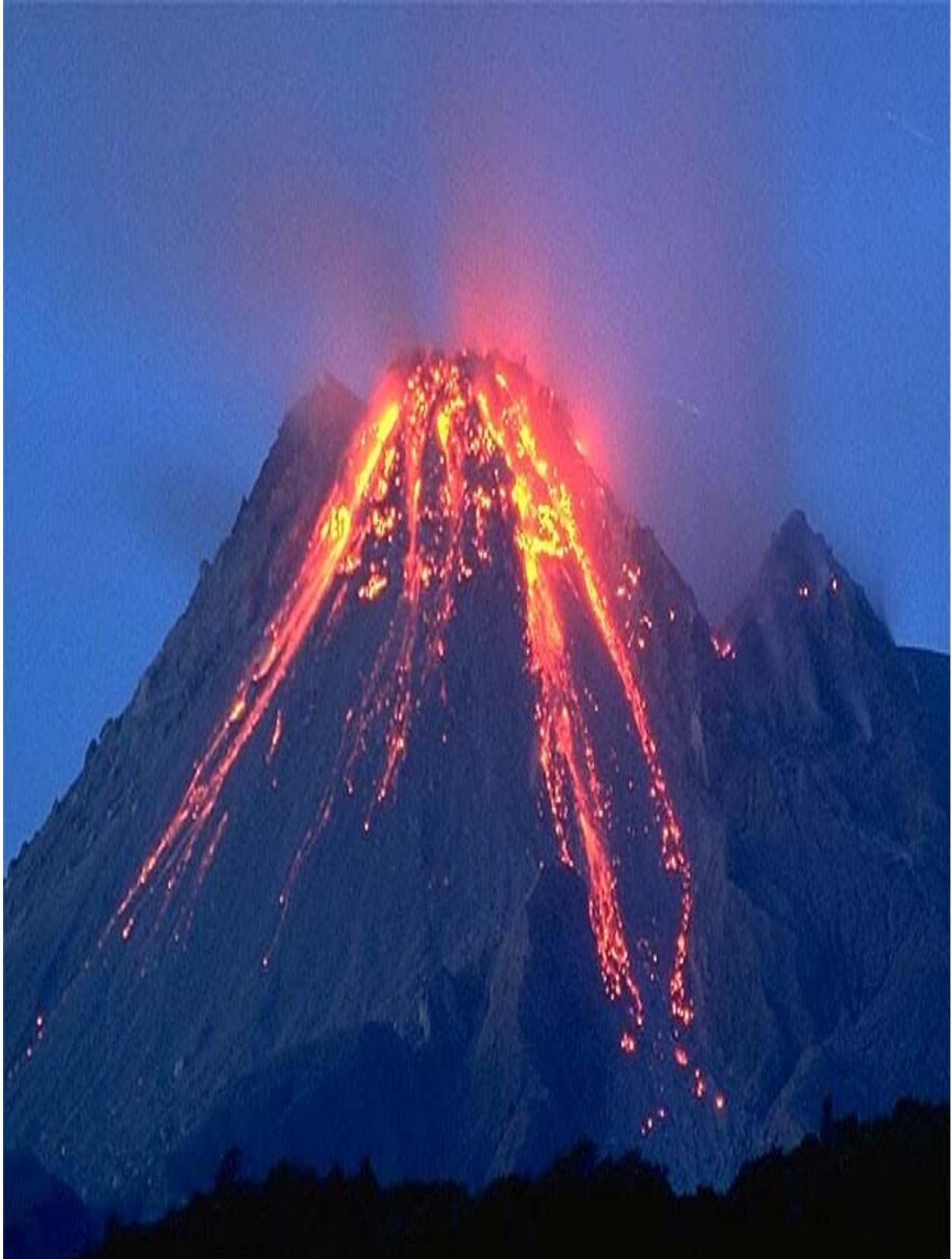
Montserrat Soufriere Volcanic Hill